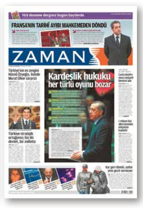
Category 1: Coldset-offset printing on newsprint Printing site: Ankara, Turkey