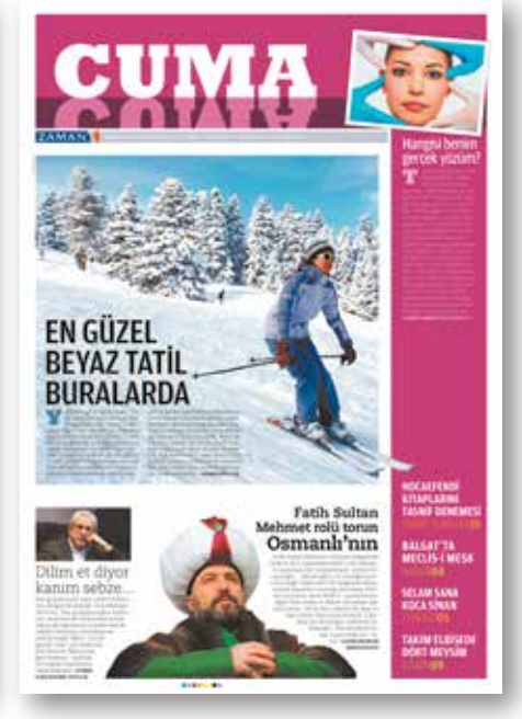
Category 1: Coldset-offset printing on newsprint Printing site: Trabzon, Turkey