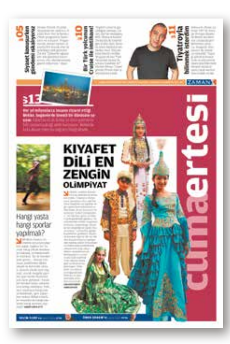
Category 1: Coldset-offset printing on newsprint Printing site: Adana, Turkey