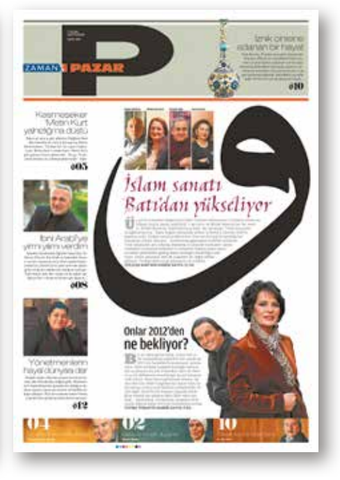
Category 1: Coldset-offset printing on newsprint Printing site: Izmir, Turkey

Zaman Media Group has 5 modern printing facilities around the country and they are located in İstanbul, Ankara, İzmir, Adana and Trabzon. Zaman is primarily sold by subscription, accounting for 90 % of its total circulation.